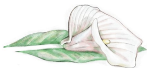
Called home to heaven: Leona Ironside